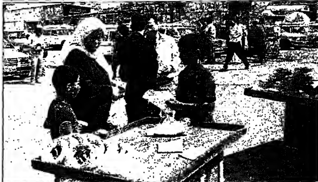
Gaza children sell cakes to help raise money for their families yesterday. Thousands of Palestinian children have been forced into the local labor market after their fathers lost their jobs in Israel due to the closure.

THE public sector will stop hiring on August 1 as part of the government's plan to cut the budget by NIS 350 million in the remainder of 1996 and NIS 4.9 billion next year, the Civil Service Commission said yesterday. This is the first in a series of measures aimed at reducing the public sector payroll by more than 10,000 over the next 16 months. The cabinet agreed to lower the manpower level by 2 percent. The cuts are intended to go much further than the Civil Service and will include local authorities, civilians in the defense forces, health fund employees, trade unions, universities, and the school system. The Histadrut said it does not object to such administrative changes, as long as the government does not reduce the rights of existing workers. However, it added that it hopes the government will also refrain from making any political appointments while the freeze is in place. Even if the government succeeds in reducing the public sector by 10,000, adding about 0.5% to the overall unemployment rate, economists say this would not take into account the net growth of departmental payrolls, which come as a natural result of factors such as population growth. In 1995, 551,000 people were employed in the public sector, according to Bank of Israel statistics. The 2% reduction will be followed by annual cuts of 1% until 2001.